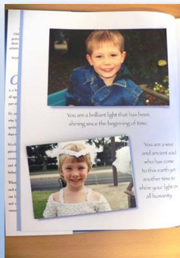
With New Photos

Photo Selection: Choose your favorite photos and simply find similar-sized photos in the book to cover up with the ones you are placing. You can even put your own photo on the back cover — that one is 3.5x5.